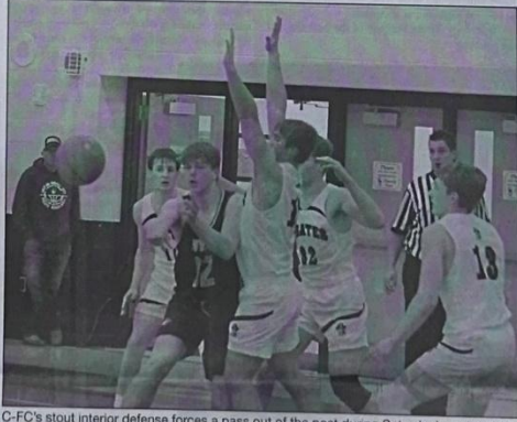
C-FC's stout interior defense forces a pass out of the post during Saturday's regional final vs. Loyal.