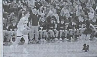
C-FC handles backcourt pressure from O-F in the Pirates' final regular season home game.