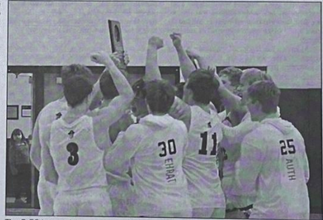
The C-FC boys celebrate receiving their regional championship plaque.